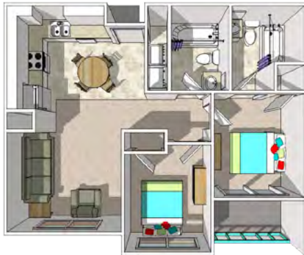
Two Bedrooms/Two Bath ▶ 750 sq. ft.