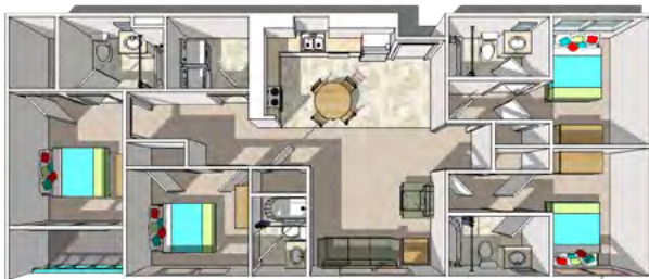
Four Bedroom/Four Bath ▶ 1300 sq. ft.