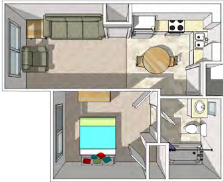
One Bedroom/One Bath ▶ 490 sq. ft.