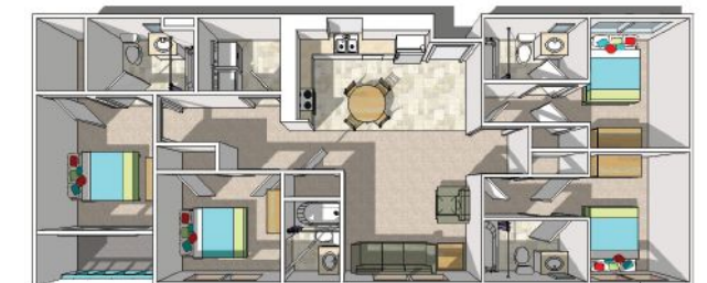
Four Bedroom/Four Bath ▶ 1300 sq. ft.