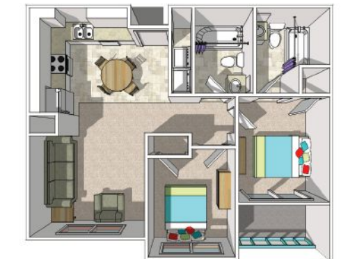
Two Bedrooms/Two Bath ▶ 750 sq. ft.